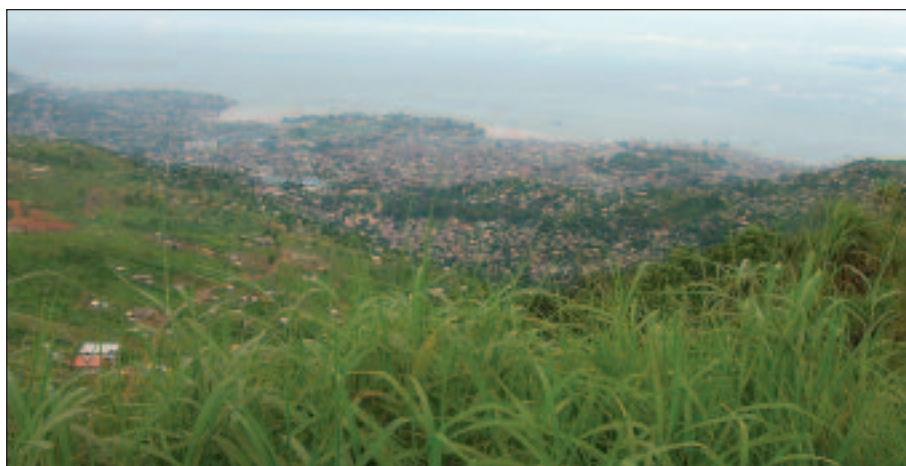
The view over Freetown in Sierra Leone

Following the success of this pilot project, the NUT plans to submit further bids to facilitate similar programmes in other African countries.